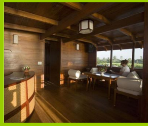
Restaurant & Bar